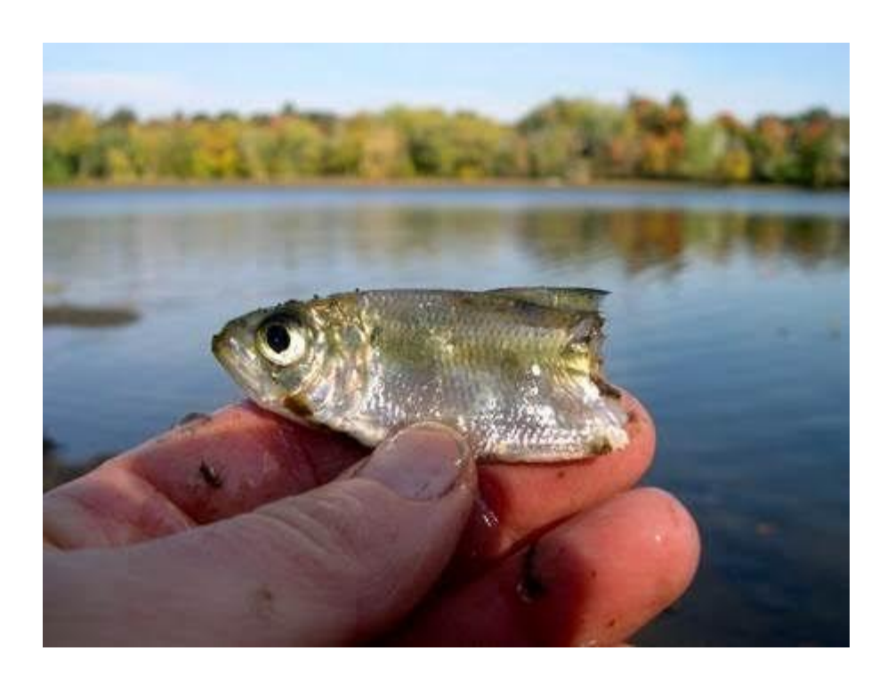
A fish found last weekend below the Androscoggin River Dam between Brunswick and Topsham.